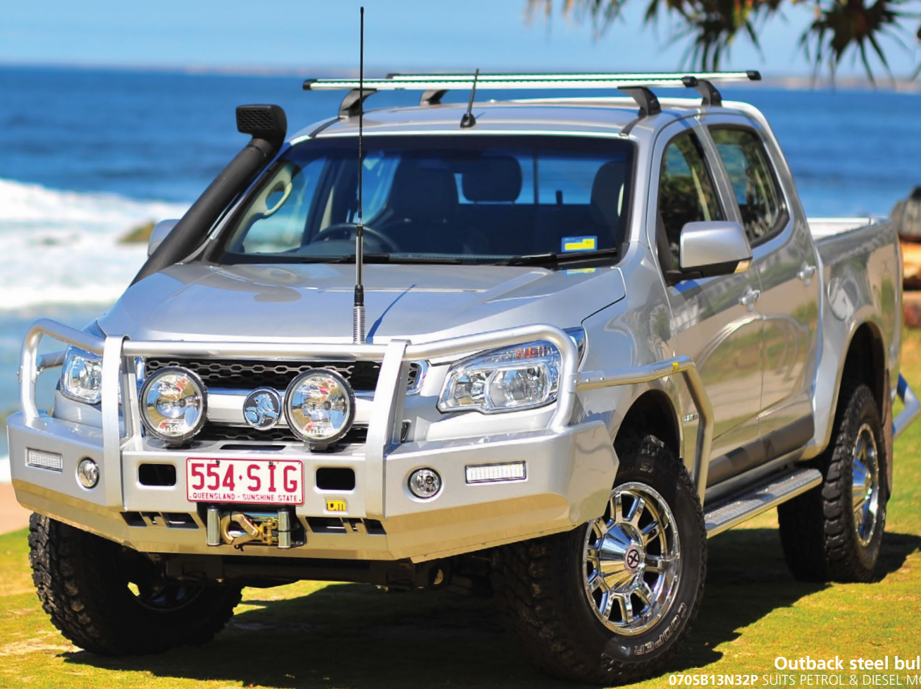
Outback steel bull bar 070SB13N32P SUITS PETROL & DIESEL MODELS