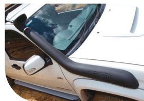
PN. 011SAT0132G (Diesel) PN. 011SAT0232G (Petrol) SUITS 2003-2008 RODEO