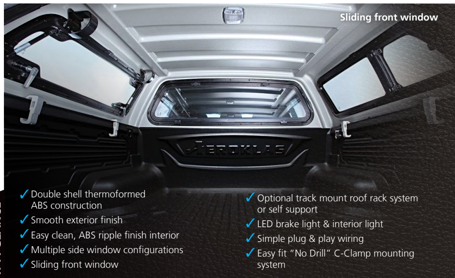
Sliding front window