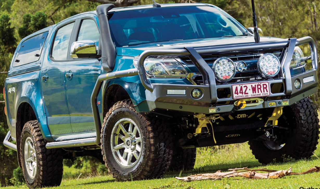
Outback steel bull bar 070SB13L32R SUITS DIESEL MODELS